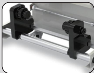
Roll up upgrade