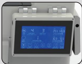
Upgrade the operating interface